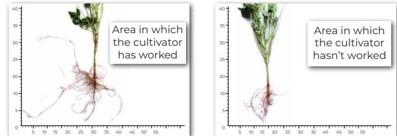
Well developed root